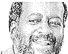
Z Pallo Jordan profile